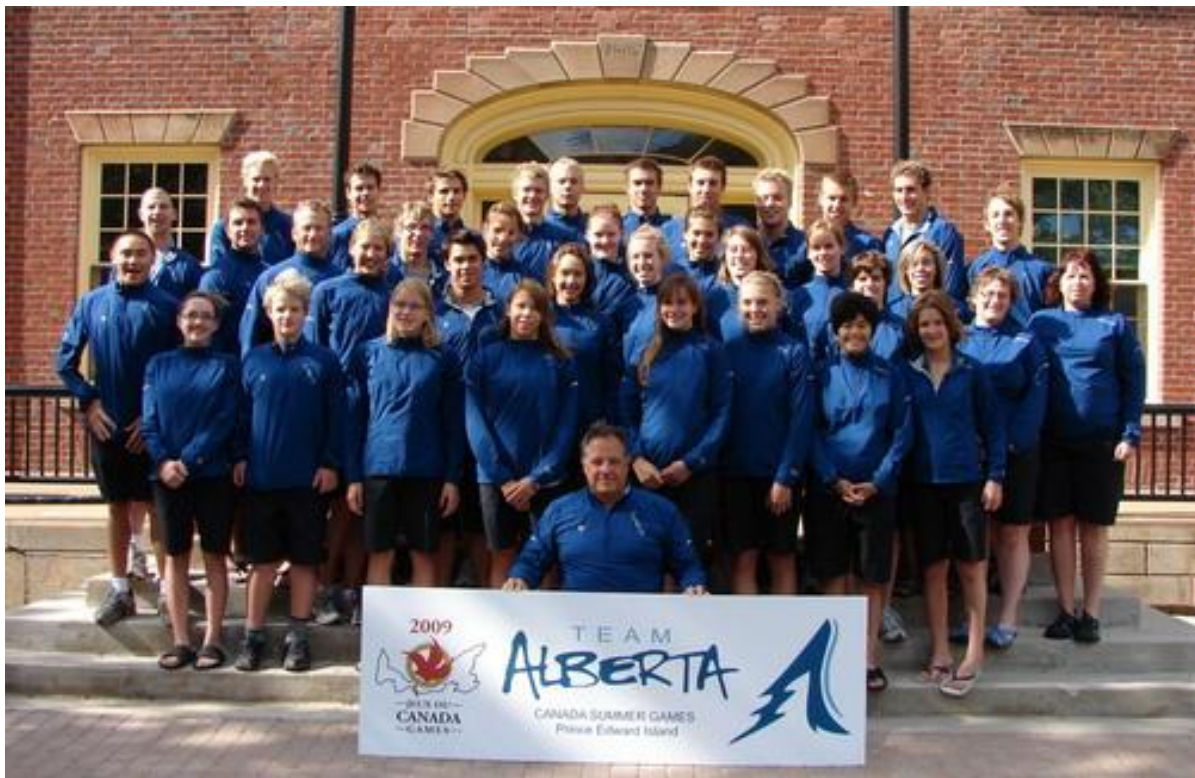
Canada Summer Games – Charlottetown - PEI